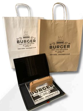
BAG & BOX STAMPS