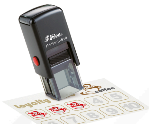
LOYALTY CARD STAMPS